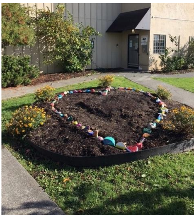
Pictured: A heart garden arrangement created by the tenants of Ryan Hill Apartments in their community garden. It is symbolic of the healing capacity of supportive housing.

There are examples of excellence in leadership through change every day in MHSU in Island Health as our staff and leaders don and doff the different hats of change leadership.