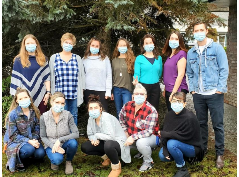
Pictured: The Adult Short Term Assessment and Treatment Team and the Substance Use Team at Baron's Road in Nanaimo.

The Adult Short Term Assessment and Treatment Team and the Substance Use Team at Baron's Road in Nanaimo have been busy with program development. Over recent months, the team has assessed gaps in services and developed working groups to address these gaps. They have revamped their group counselling program and are providing in-service training to partnering teams within MHSU to highlight the current and upcoming changes, and to seek feedback regarding client needs. Kudos to the Baron's Road team for taking initiative and driving change!