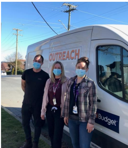
Pictured: The Nanaimo Primary Care Outreach team.

I myself do not believe in the bible ... but I do believe in angels and angels walk among us and you are them, with hidden wings, halos and hearts. I thank you for being the wonderful you that you are and I believe in you. Thank you! I now have another story to tell because of the angels among us."