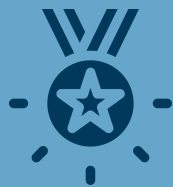
Youth Harm Reduction Award

Island Health has recognized three Nanaimo youth for their efforts to promote harm reduction awareness and training at their school, Learning Alternatives. They have been honored with our Youth Harm Reduction Award .