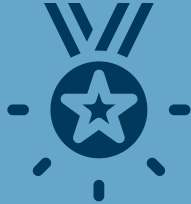
Youth Harm Reduction Award