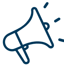
Updated Naloxone Course BCCDC

The BCCDC Naloxone course has been updated. You can click here to go directly to a self-paced Naloxone 101 course that you can take online right now or anytime that's convenient for you.