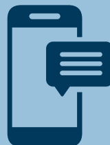
Toxic Drug Health Alerts

Service Link (1-888-885-8824) is a toll-free information line that assists individuals with accessing mental health and substance use services across the Island Health region. Staffed by experienced Addiction & Recovery Workers, Service Link operates daily from 8:30 AM to 4:30 PM. Order resource cards to share with your networks by contacting decriminalization@islandhealth.ca .