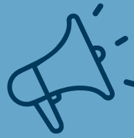
Updated Naloxone Course BCCDC