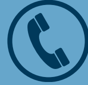
MHSU Service Link