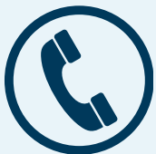
MHSU Service Link

The BCCDC Naloxone course has been updated. You can click here to go directly to a self-paced Naloxone 101 course that you can take online right now or anytime that's convenient for you.