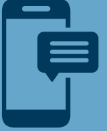
Toxic Drug Health Alerts