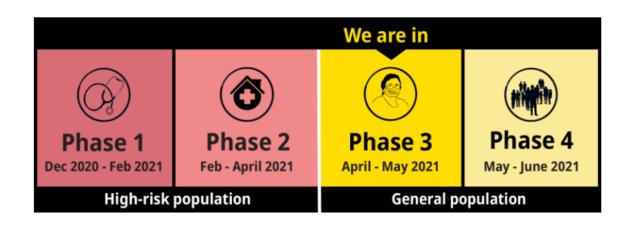
April 21, 2021 – Health System Capacity, Registration Ramp-Up, and New Public Health Measures

Since our last update, Island Health and other BC health authorities witnessesed a day-over-day incremental surge in public illness, emergency visits, and COVID-19 hospitlizations. Our acute care system experienced significant occupancy issues and challenging staffing levels that had our designated COVID hospital sites working at capacity for several days. With <u>increased systemic pressure</u> at the provincial level, Dr. Bonnie Henry and health officials enacted several <u>new province-wide restrictions</u> in effect until May 25<sup>th</sup>, 2021 (see section below). Moreover, <u>British Columbia's vaccination program</u> has been expanded in communities with higher COVID rates as a key lever to prevent hospitals from becoming overwhelmed.