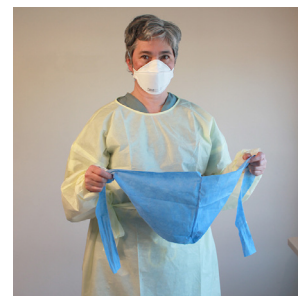
7. Place hood on head, cross ties at front to cover neck, tie in the back, ensuring ears and hair are covered.