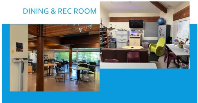
DINING & REC ROOM

Holistic care is provided by an interdisciplinary care teams including LPNs, RNs, RPNs, Social Workers, Mental Health Support Workers, and Psychiatrists.