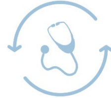
Chart Completion Reminder

A friendly reminder to please complete your charts to help support quality care transitions and patient care delivery.